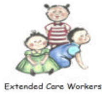
Extended Care Workers