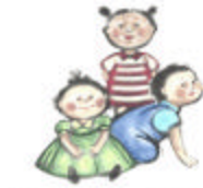
Extended Care Workers