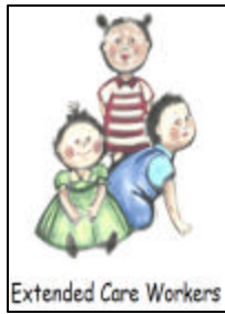
Extended Care Workers