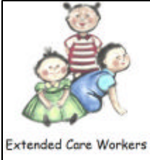
Extended Care Workers