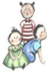
Extended Care Workers