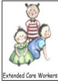
Extended Care Workers

Bring a side dish, dessert or A door prize Invite a Friend! Table Hostesses Needed