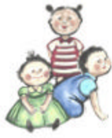
Extended Care Workers

They are practicing for their Christmas programs so now would be a good time to join them. They meet every Thurs. at 10:00 a.m. Their 1st program is Dec. 3rd at Green Tree Retirement Center.