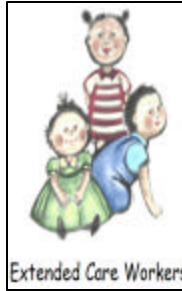
Extended Care Workers