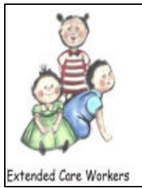
Extended Care Workers