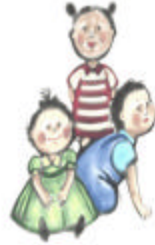
Extended Care Workers